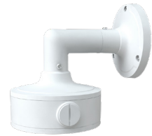
GGM AJB010+GGM AWMB017