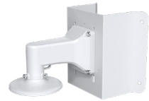
GGM AWMB019+GGM ACMB001