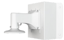
GGM AWMB003+GGM ACMB001