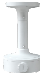
GGM AJB007+GGM ATMB003