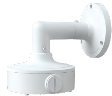
GGM AJB007+GGM AWMB017