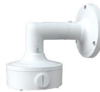
GGM AJB013+GGM AWMB016