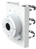
GGM AJB009+GGM APMB001