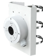
GGM AJB009+GGM APMB001