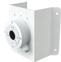
GGM AJB009+GGM ACMB001